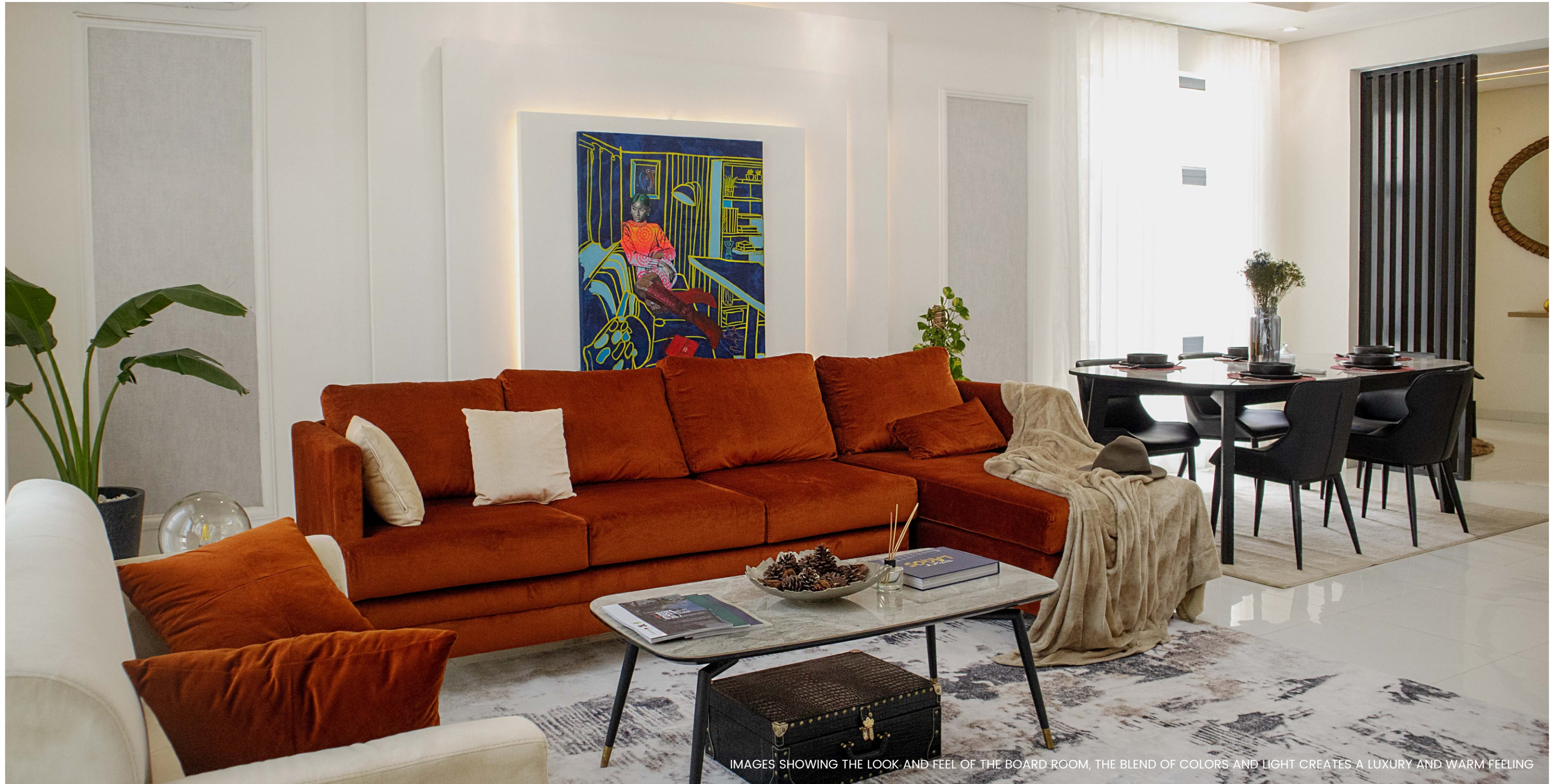
IMAGES SHOWING THE LOOK AND FEEL OF THE BOARD ROOM, THE BLEND OF COLORS AND LIGHT CREATES A LUXURY AND WARM FEELING