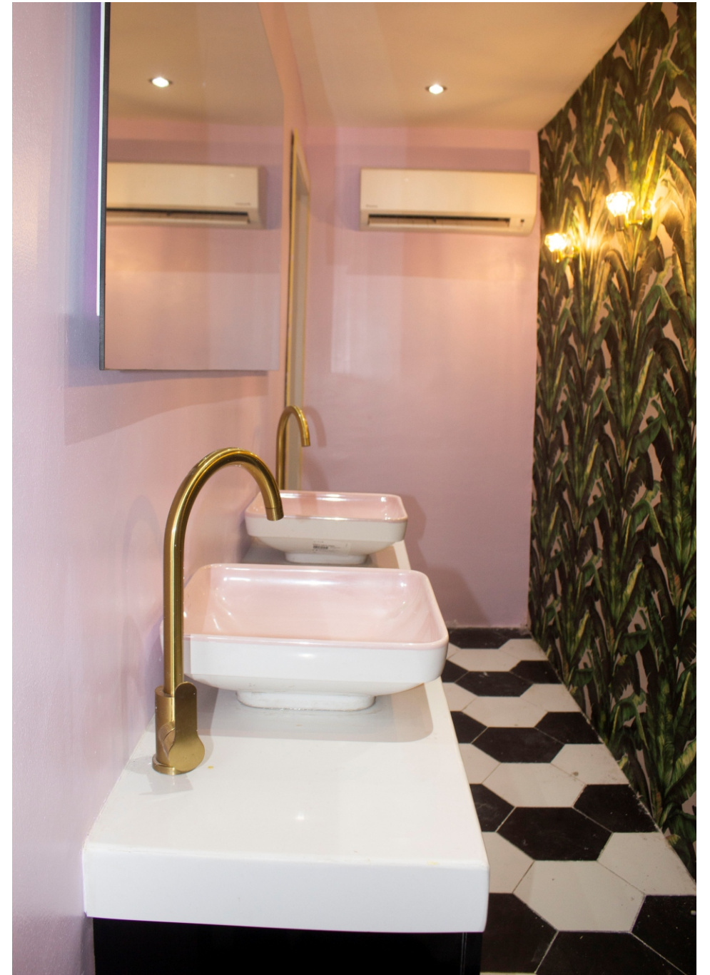
PROJECT TITLE: FLORENCE H