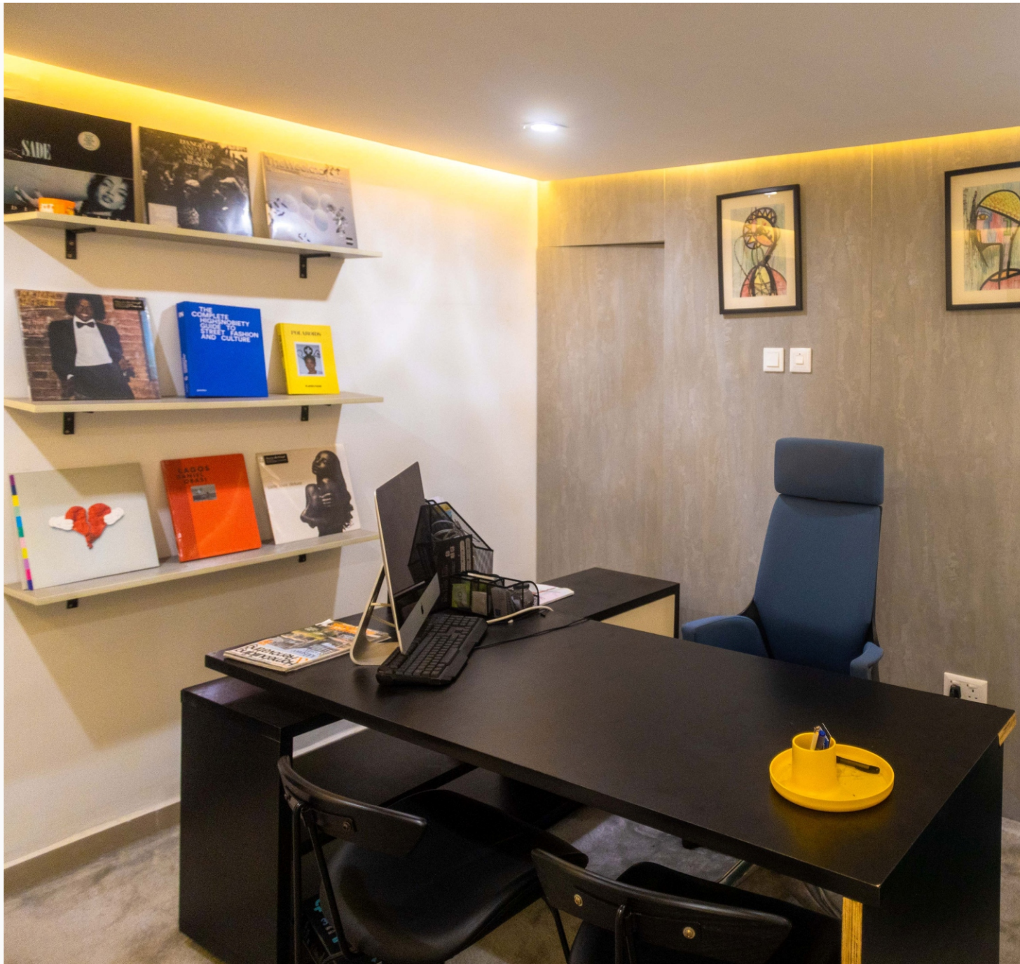
IMAGES SHOWING THE LOOK AND FEEL OF THE BOARD ROOM, THE BLEND OF COLORS AND LIGHT CREATES A LUXURY AND WARM FEELING